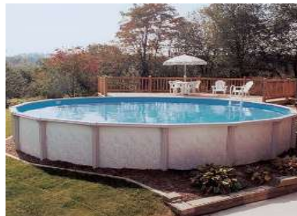
EXAMPLES OF APPROVED ABOVE-GROUND POOLS